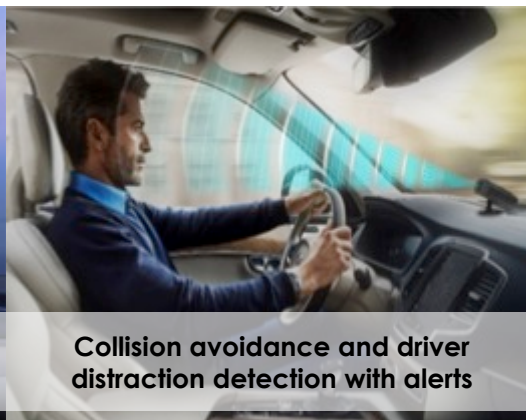
Collision avoidance and driver distraction detection with alerts