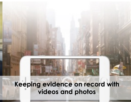
Keeping evidence on record with videos and photos